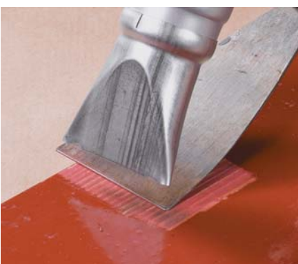
Paint stripping PIC PRO PLUS