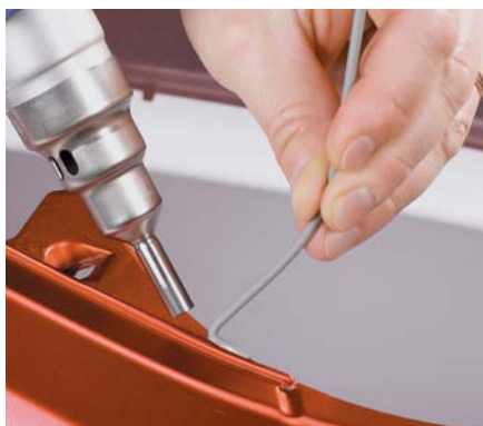
Pendulum welding PLUS