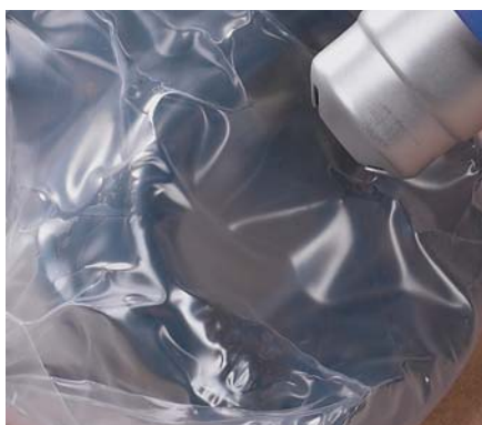
Shrinking PIC PRO PLUS