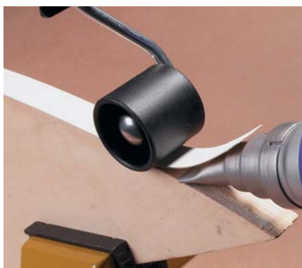
Edge banding PLUS