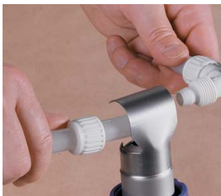
Forming PIC PRO PLUS