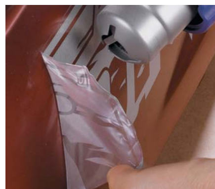
Remove of stickers and films PIC PRO PLUS