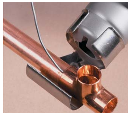
Soldering of copper tubes PRO PLUS