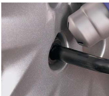
Loosening of screws PIC PRO PLUS