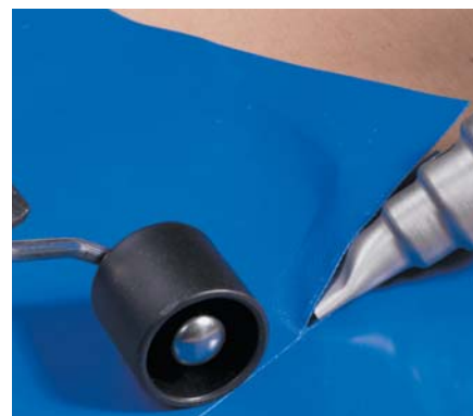
Repair welding PLUS